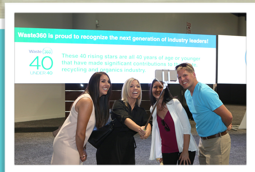
A selfie moment in front of the Jumbo Video Screen last year!